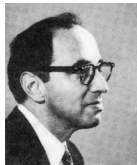
Thomas Kuhn (1922–1996)