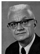
Carl G. Hempel (1905–1997)