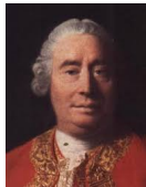
David Hume (1711–1776)