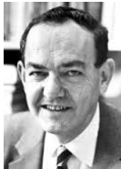
Herbert Simon (1916–2001)